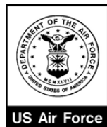
US Air Force

FOR ADDITIONAL QUESTIONS, CONTACT THE LEISURE SERVICES DEPARTMENT AT 954-747-4600.