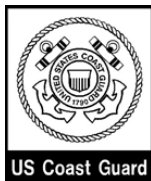
US Coast Guard