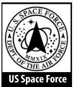
US Space Force