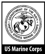
US Marine Corps