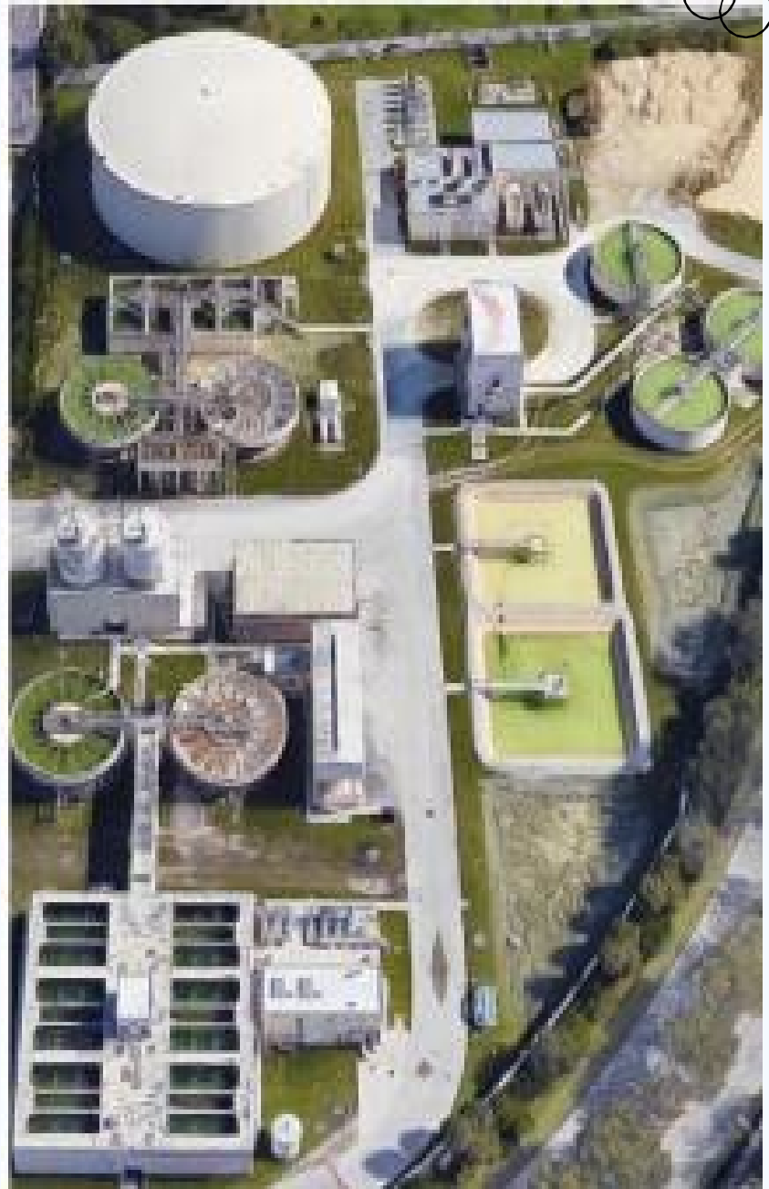
Picture 1: Aerial photo of the Springtree Water Plant