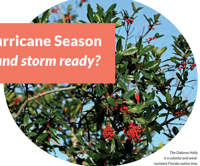
The Dahoon Holly is a colorful and wind-resistant Florida-native tree.

Tree placement in a landscape is an important factor. Trees planted in a group are more storm-resistant than solitary trees. FPL’s Right Tree, Right Place guidelines ( https://www.fpl.com/reliability/trees/tree-location.html ) can help you consider important safety issues—such as a tree’s shape, size and growth rate—before you plant.