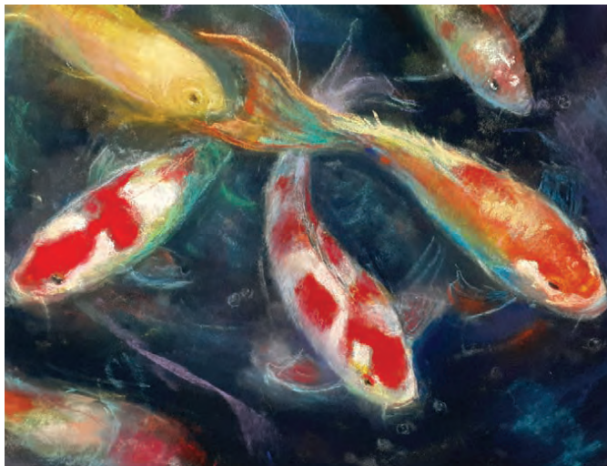
Artwork from Visions of Women