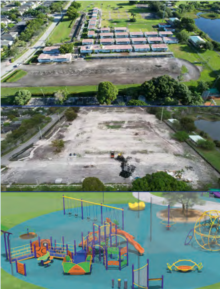
Pictured top to bottom: Oscar Wind before construction; After demolition; Playground rendering