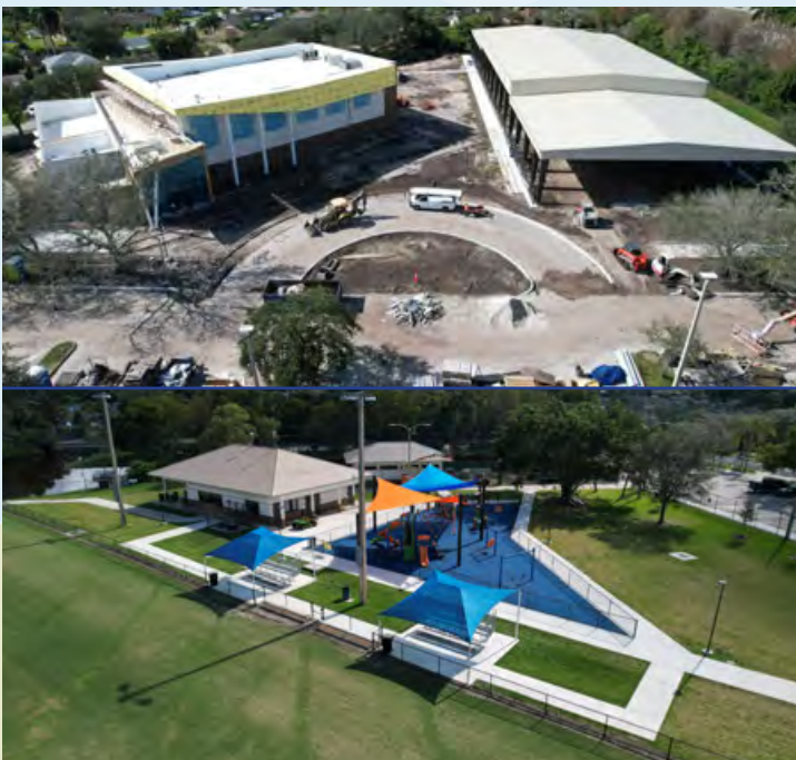
Pictured top: SAC multipurpose building and covered basketball courts under construction; Pictured bottom: new playground