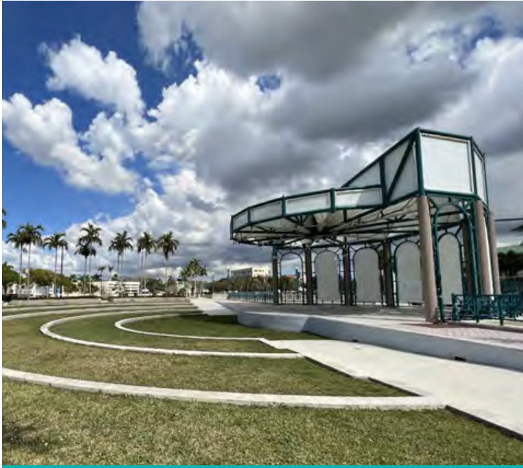
The Sunrise Civic Center Amphitheater is the home of the City's popular Tunes 'N Trucks concert series and other special events. An amphitheater expansion is planned as part of enhancements to the municipal complex.