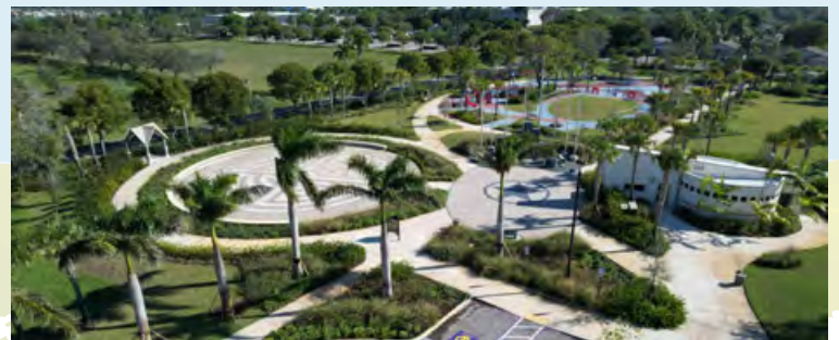
Pictured top: Roarke Hall pool and splash pad; Pictured bottom: Veterans Park