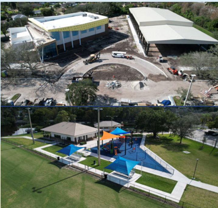
Pictured top: SAC multipurpose building and covered basketball courts under construction; Pictured bottom: new playground