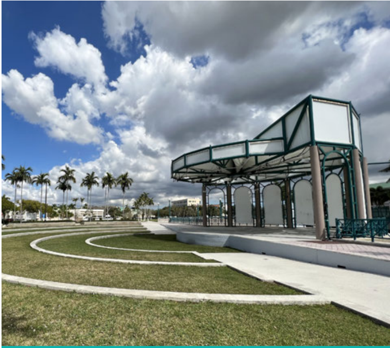
The Sunrise Civic Center Amphitheater is the home of the City's popular Tunes 'N Trucks concert series and other special events. An amphitheater expansion is planned as part of enhancements to the municipal complex.