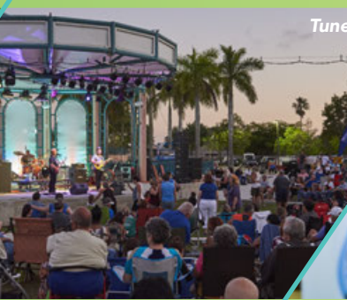
Tunes 'N Trucks