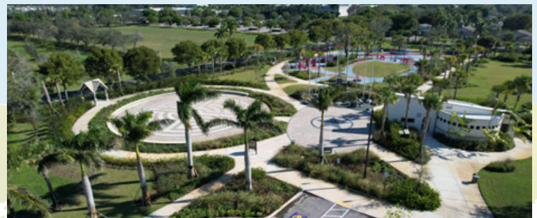
Pictured top: Roarke Hall pool and splash pad; Pictured bottom: Veterans Park