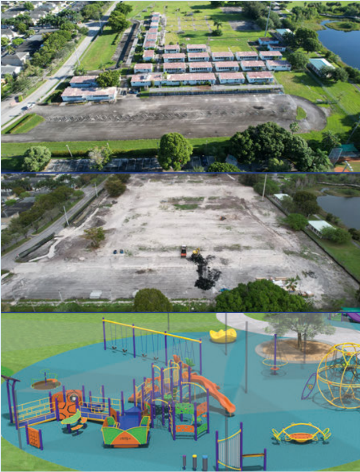
Pictured top to bottom: Oscar Wind before construction; After demolition; Playground rendering