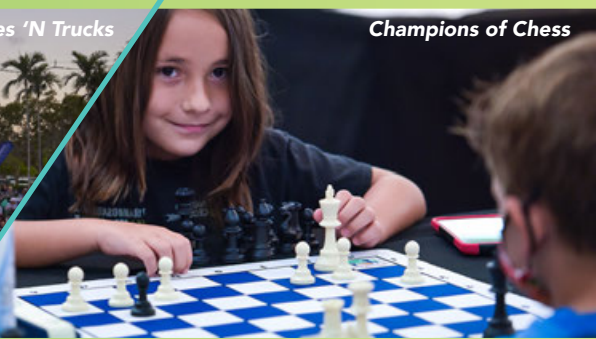
Champions of Chess