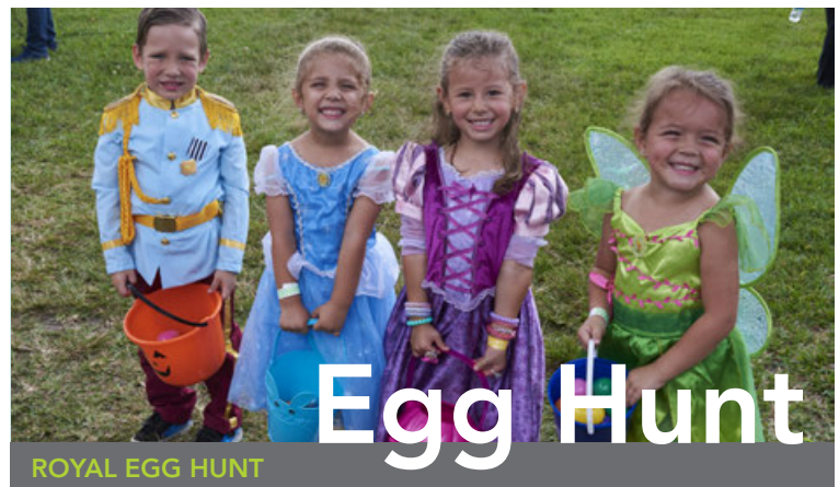
ROYAL EGG HUNT