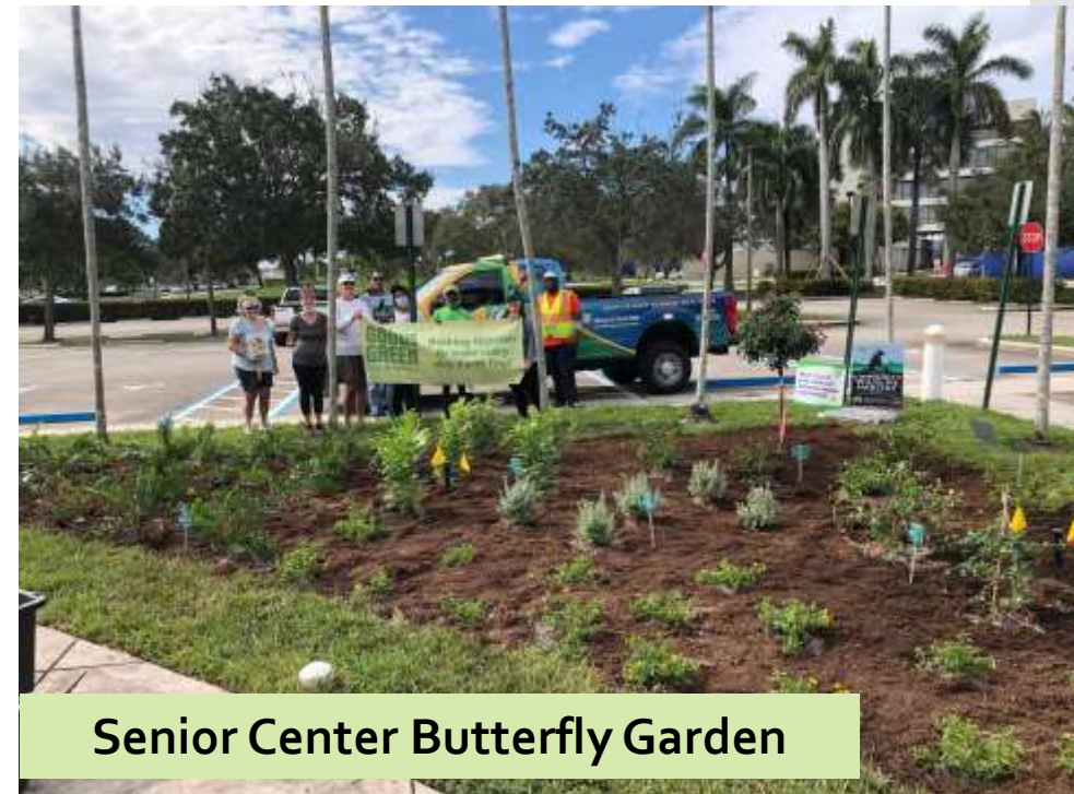
Senior Center Butterfly Garden