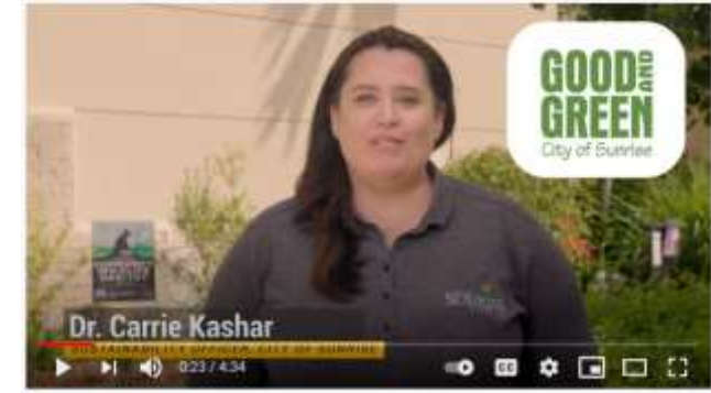
#SeeItSunrise #SouthFlorida Sunrise Good and Green Episode 1: Butterfly Gardening