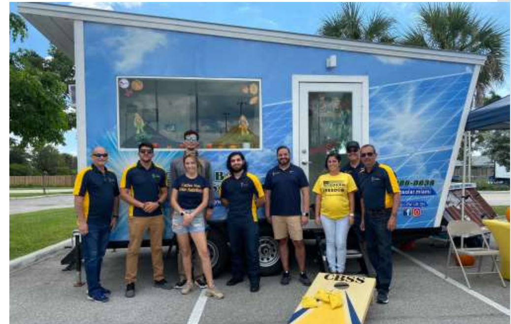
Solar Tiny Home at Fall Harvest Fest 2021