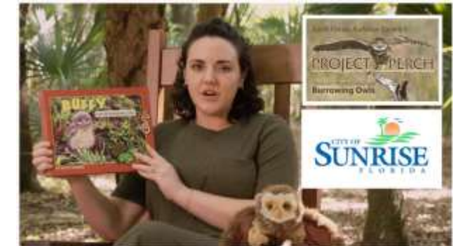
#SeeItSunrise #SouthFlorida Sunrise Good and Green Episode 2: "Buffy the Burrowing Owl"