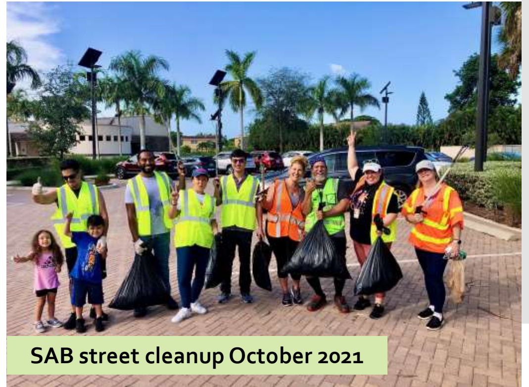
SAB street cleanup October 2021