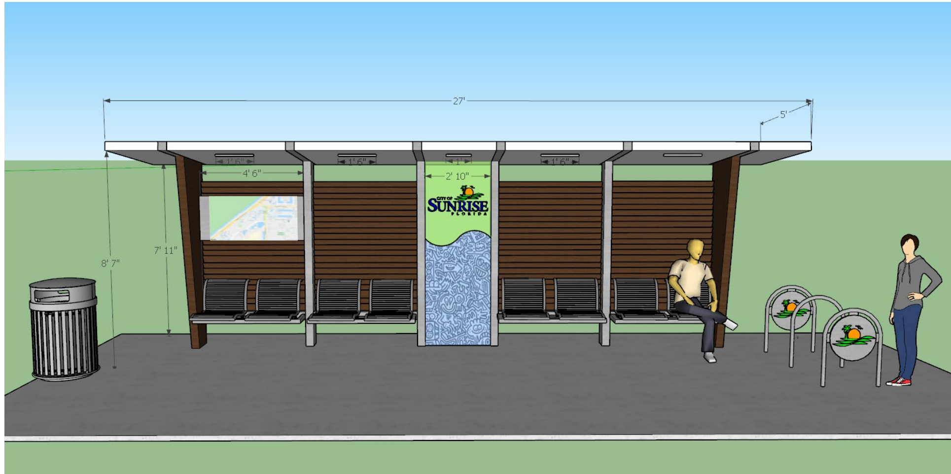
Narrow Shelter with 8 seats plus a wheelchair space