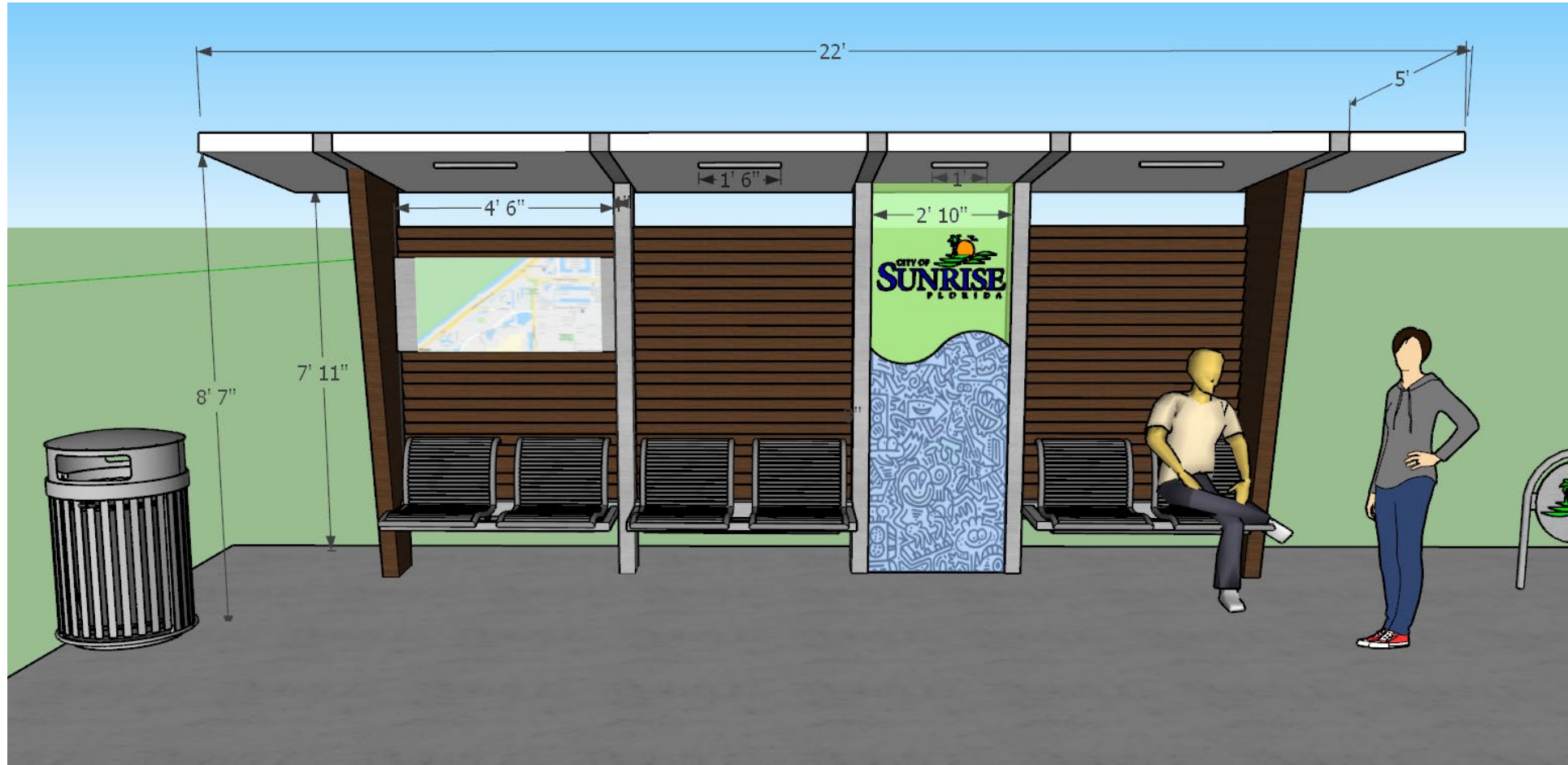
Narrow Shelter with 6 seats plus a wheelchair space