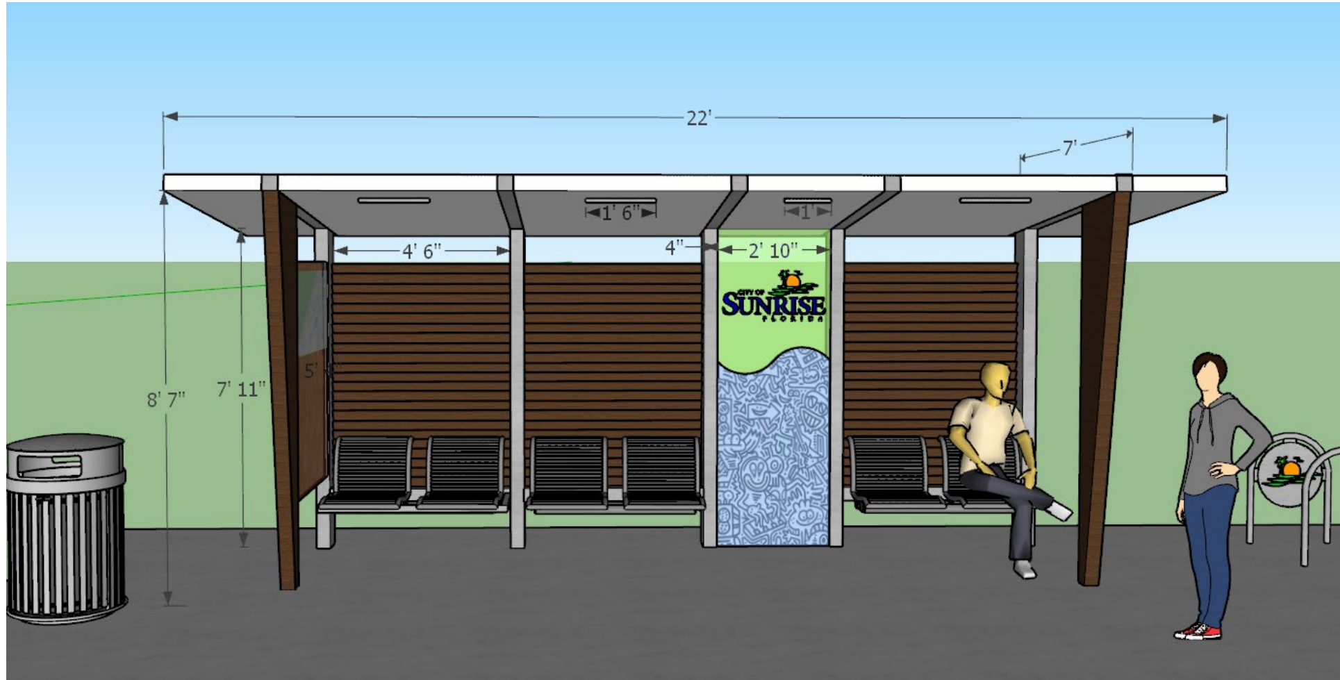
Standard Shelter with 6 seats plus a wheelchair space