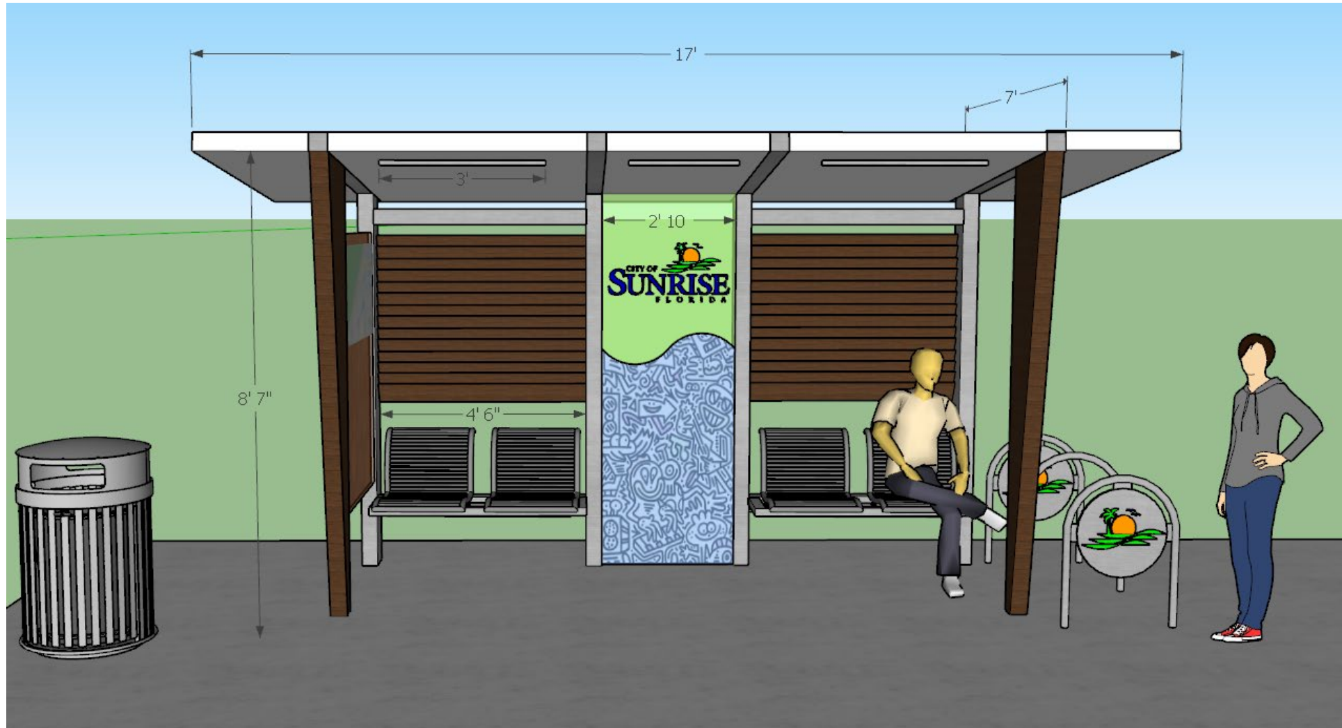
Standard Shelter with 4 seats plus a wheelchair space